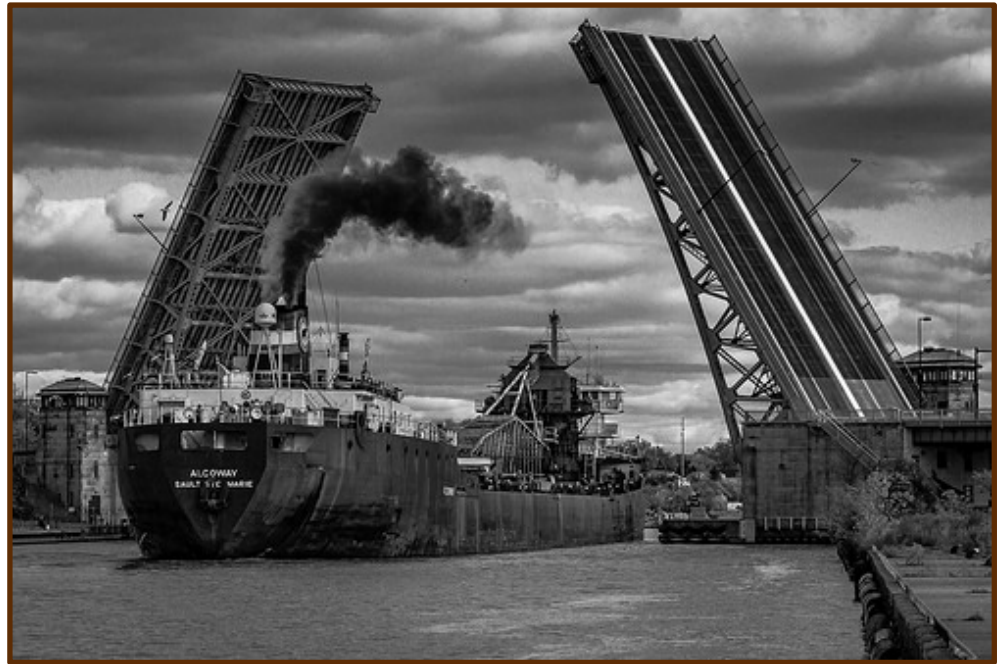
Bascule Bridge and Freighter

The purpose of this Annual Report is to inform the watershed community and our stakeholders of the progress made on removing BUIs and restoring the AOC. If you would like more information on any of the topics covered, or would like to join the effort to restore the Black River, please contact any of the AOC Advisory Committee members listed at the end of this report, or visit www.blackriveraoc.com .