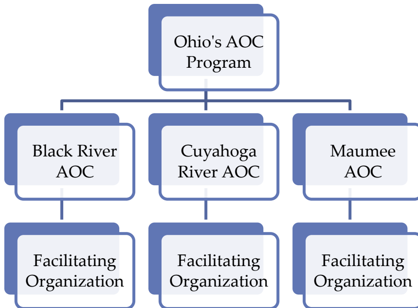
Figure 2 - Ohio's AOC Local Facilitating Organizations

Although a local AOC Facilitating Organization may choose to also be a project implementer, an AOC Facilitating Organization is not typically expected to implement significant or large management action projects. Most management actions in an AOC will usually be implemented by local governments, park districts, and other land holding entities within the AOC with the support of the AOC Advisory Committee. As all BUIs are removed in an AOC and it is delisted, the Advisory Committee will cease to exist as an advisory organization for the Ohio AOC Program. It may choose to remain as an organization but with a different mission upon the delisting of an AOC. Without the existence of an AOC or an Advisory Committee, the Facilitating Organization is also not needed by the AOC Program; therefore, it will no longer receive support funding from the Ohio AOC Program.